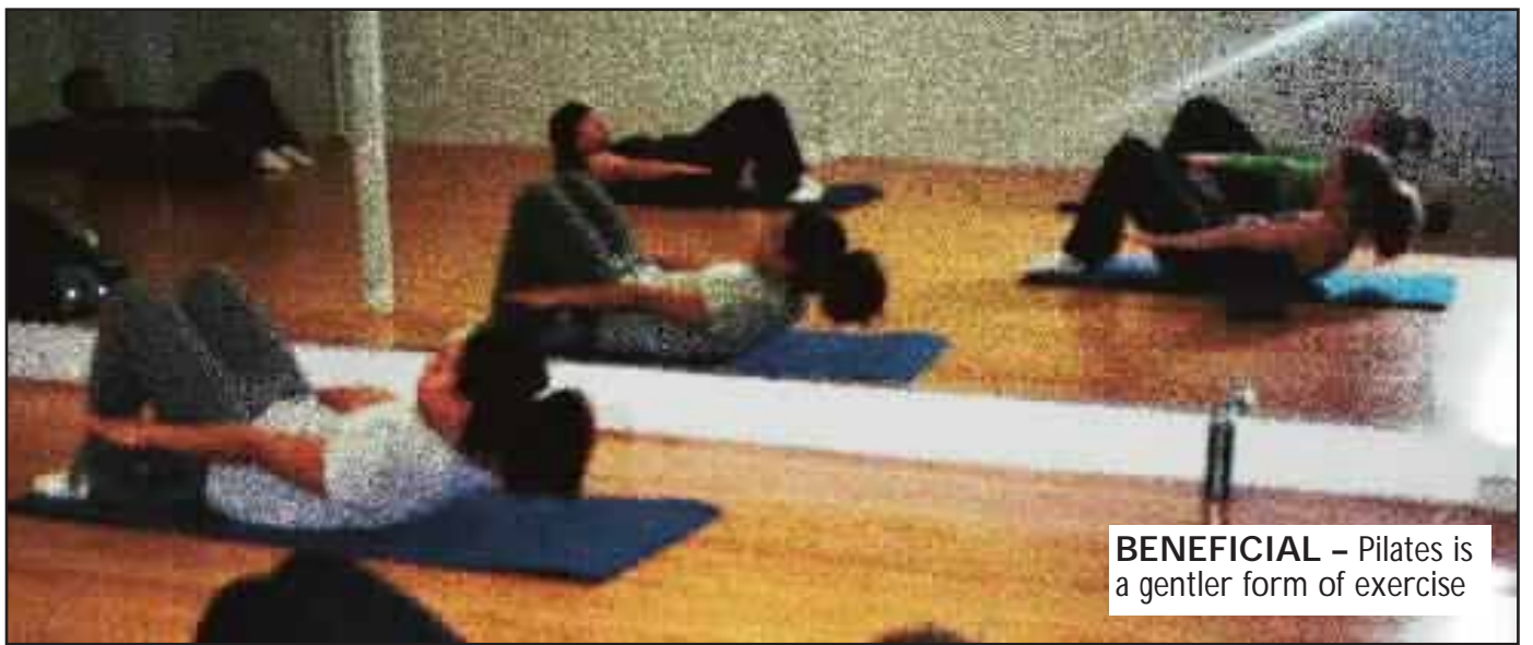
BENEFICIAL – Pilates is a gentler form of exercise

1 Thames Court, High Street, Goring on Thames, Oxon RG8 9AQ