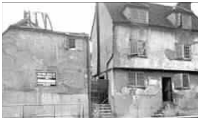
Going going... Numbers 4, 6 and 8 Farnham Road.