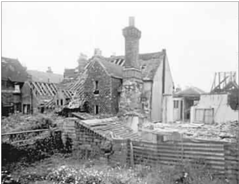
A view of the backs of the cottages with demolition well under way.