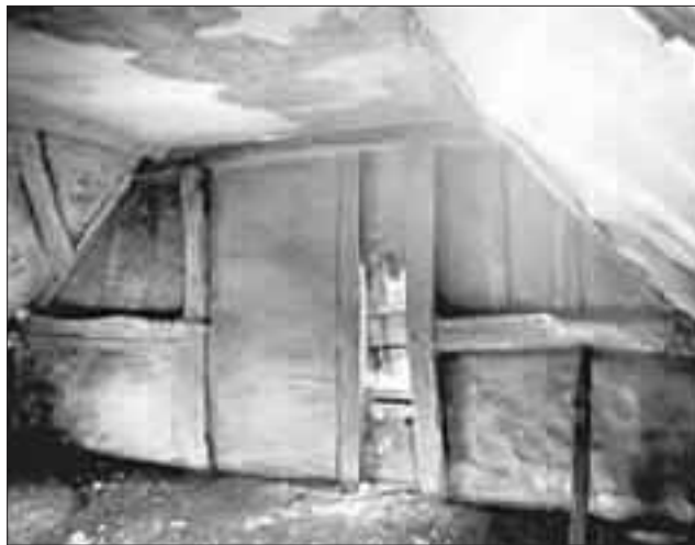
Upstairs in one of the Farnham Road cottages.