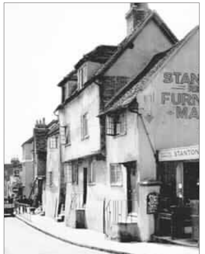
A rare view of the cottages looking back down Park Street. The hanging sign outside the Plough pub can be seen near where the lorry is parked. On the right can be seen part of Stanton's household furniture store.