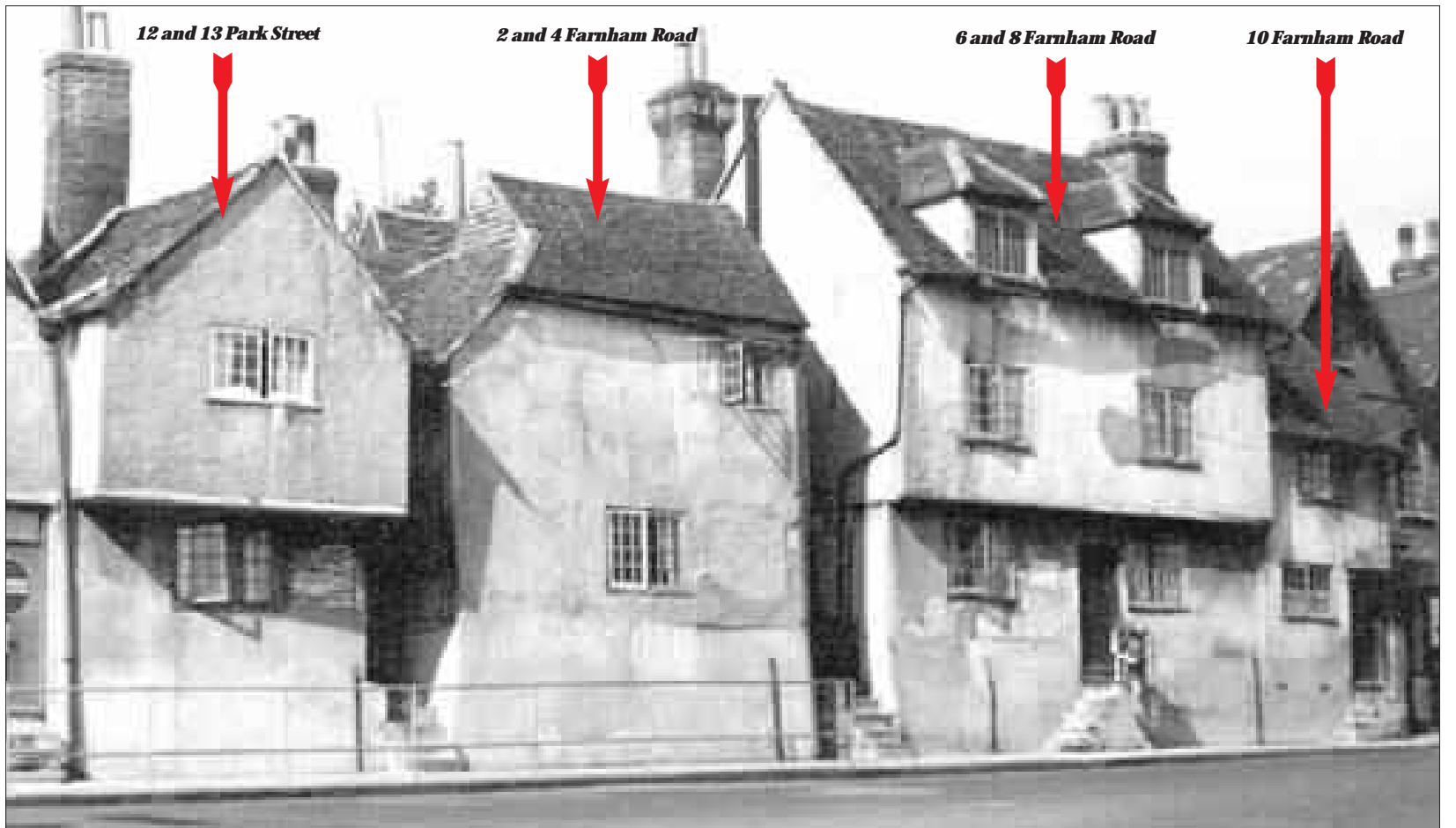
Possibly the best view of the cottages in Park Street and Farnham Road. The arrows and numbers have been added to tie in with Matthew Alexander's article. The vintage pictures seen on this page are courtesy of Guildford Museum. Thanks also to Philip Hutchinson who e-mailed an almost identical photo to the one above.

However, there grew an increasing feeling that historic buildings should be conserved wherever possible, and today it seems unlikely that, in the same circumstances, the cottages would have been destroyed.