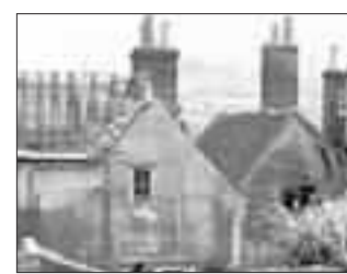
From left, the backs of numbers 2 and 4 Farnham Road and number 13 Park Street. The department store Harvey's in the High Street can just be seen on the skyline.