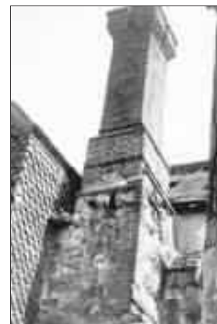
A rather splendid chimney.