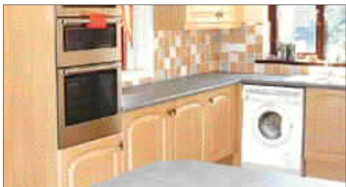
Above: a kitchen transformed by Re-Nu. Right: how it looked before.

For more details or a survey and quotation for your kitchen, call freephone 0800 195 8641, or visit www.re-nukitchens.co.uk