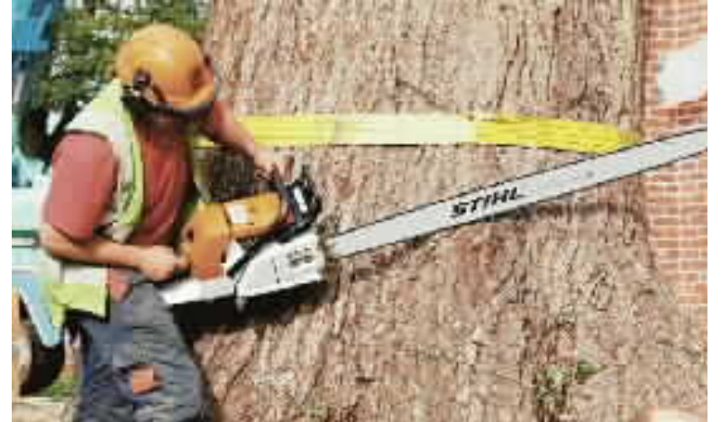
No job is too big for tree specialists Cormack and Franklin.

All green waste produced during the course of tree work is taken back to the depot, where it is recycled, by