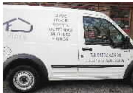
There's a wide range of stock at Fascia Place depots.

For further details call Stuart on 01483 474333.