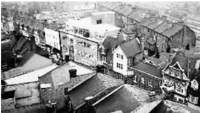
Robinson's department store is in the centre of this old photo of Chertsey Road.