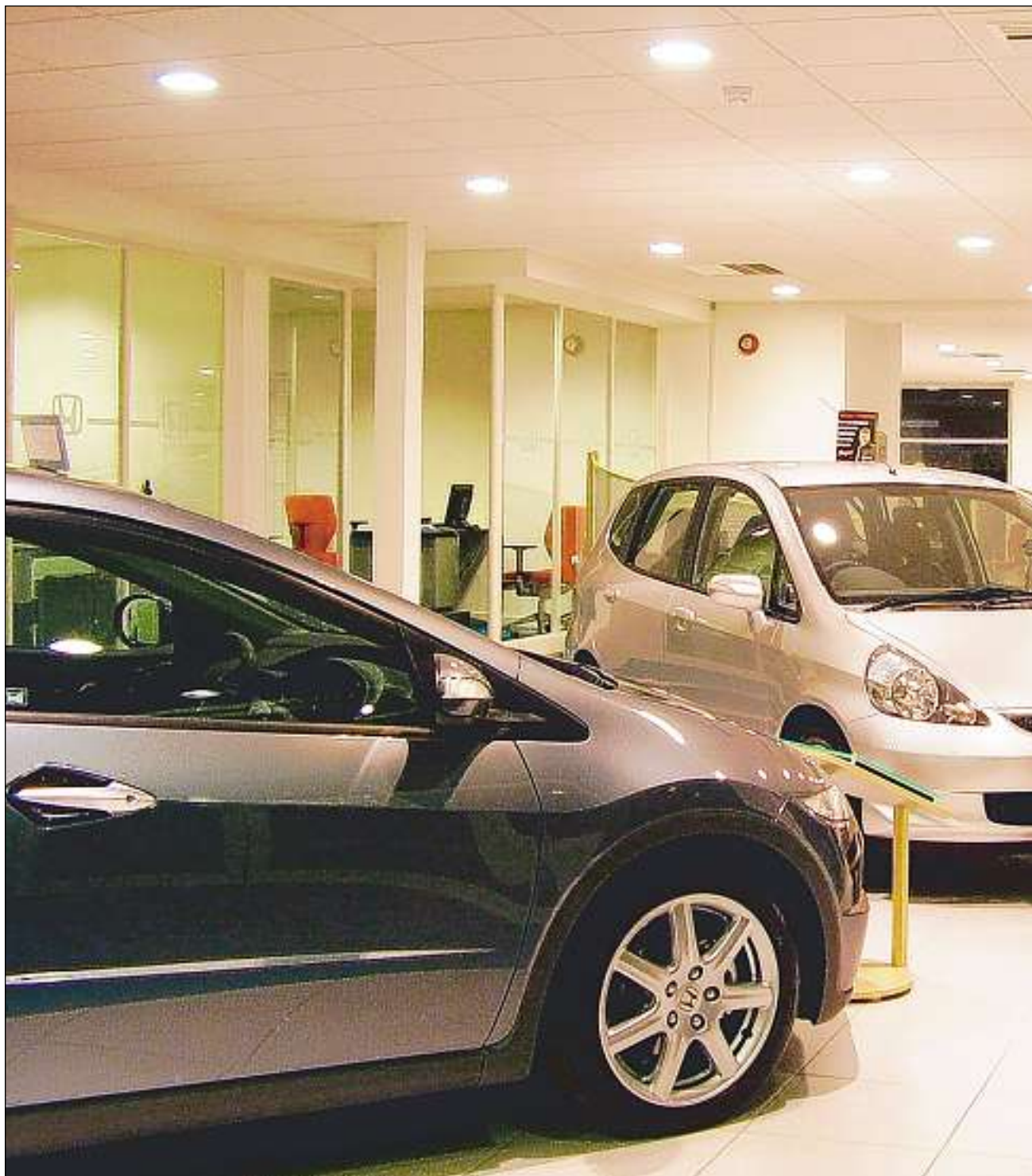
The showroom at Yeomans Honda Guildford.