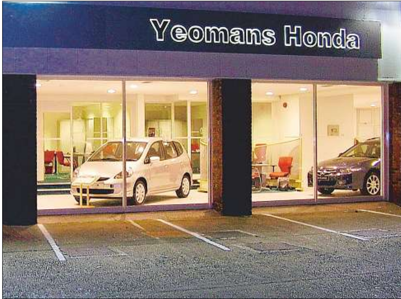
Yeomans Honda Guildford is on the A322 at Pitch Place between Guildford and Perry Hill.

ing fuel consumption and emissions are kept to a minimum. And with an impressive 5.9% APR, it's good for your pocket as well as the environment. For further information contact Yeomans Honda Guildford on 01483 234080.