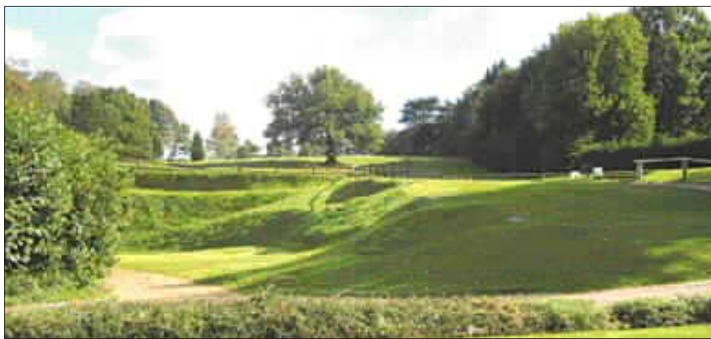
You can be sure of a warm welcome and a great course to play on at Puttenham Golf Club.