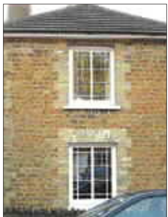
Replacement windows in a bargate stone cottage.

HAVE you ever thought you would like the efficiency of double glazing in your home but simply could not bare those thick white frames in your house?