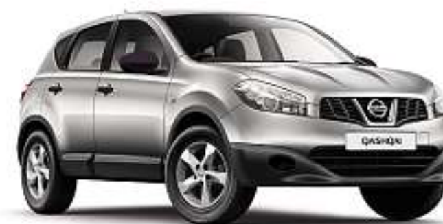
NEW QASHQAI 1.6 VISIA