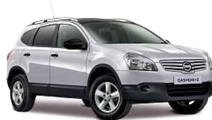
NEW QASHQAI+2 1.6 VISIA

3.9% APR* (TYPICAL) MIN 10% DEPOSIT PLUS 2 YEARS FREE SERVICING†