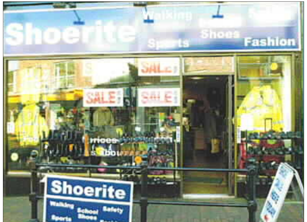
Shoerite has stores at Fairlands in Worplesdon and in Godalming.