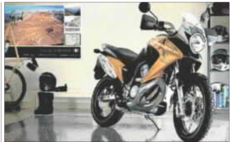
The Moto Select showroom has plenty to grab your interest.

Click on www.haslemere-motorcycles.co.uk to find out more about the company and the bikes it has available.