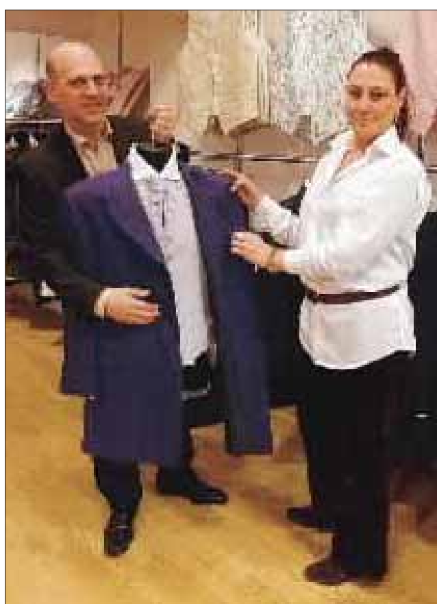
WOMEN are not the only ones who want to look their best and, thanks to a new Weybridge business, men now have the chance to shop till they drop an ensure they make heads turn too. Visit Impeccable at 119 Queen's Road, Weybridge.

For more information about Motability call 08700 553115.