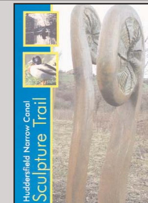
This week's walk is available as a leaflet from any tourist information point in Oldham, including libraries.

6 There are also two themed play areas for the children close by. You have now completed the journey and all that remains is to retrace your steps. As mentioned, you can follow the canal back on the opposite side for a change of scene. Enjoy.