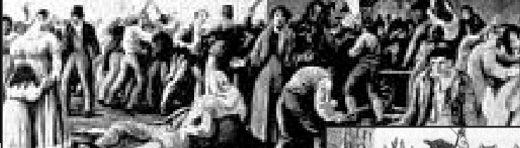
SCENES from the Peterloo massacre

Walk: Tandle Hill Distance: Around 2.5 miles. Time: One and a half hours at leisurely pace Calorie burn: 350+ How do I get there?: This walk starts from the car park at the entrance to the park on Tandle Hill Road, which is off the Rochdale Road (A671). This is one of the busiest link roads in the borough and can easily be found on any map. Public transport: The nearest bus stop is on Rochdale Road and 10 minutes walk from the start point. Call GMPTE on 0161 228 7811 for bus details. Parking: Free parking.